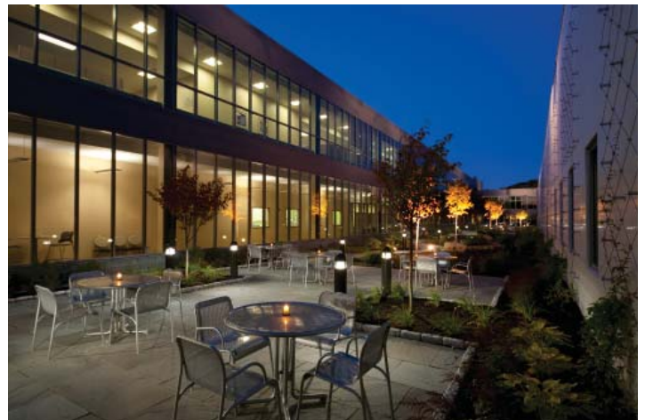
BioCourt offers employees a connection to nature